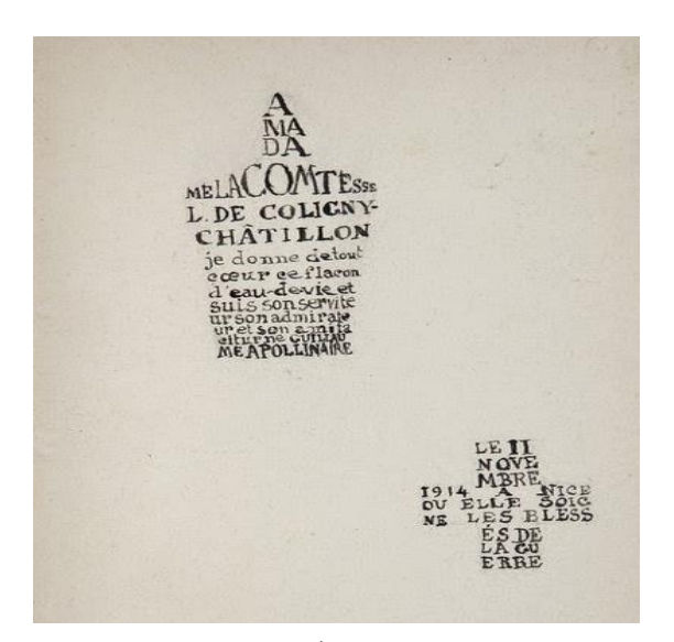
Figure 3. The Calligram "À Madame La Comtesse" This concrete poem, read vertically, produces the following transcript: