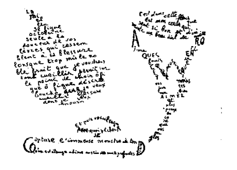
Figure 1. "La mielleuse figue-C'est dans cette fleur-Et puis voici l'engin"

The first work analyzed here, titled "La mielleuse figue-C'est dans cette fleur-Et puis voici l'engin" ('A honeyed fig—Is in the flower—As is the gear'), is a single concrete poem consisting of three calligrams (a fig, a carnation, and an opium pipe). These three calligrams were written in Nice on 8 October 1914. This discussion will begin with a presentation of the concrete poems as included in Poèmes à Lou , as follows: