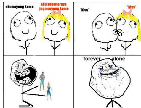
Panel 1: Boy: "I love you"

The first expression represented by the comic strip is how FAG often imagines himself to be in relationship as below,