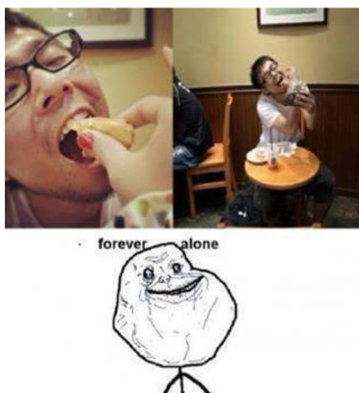
Picture 16. being lonely

In comic strips above, readers can see how FAG reacts to his loneliness, that is by playing with himself as if there is someone who plays with him. This point is also strengthened by the next picture below,