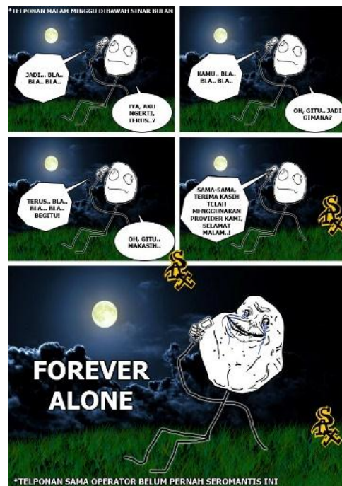
Panel 1: *calling someone on Saturday night under the moonlight [balloon text] Someone on the phone: So, bla, bla, bla | FAG: [balloon text] yea, I know. Then?

In picture 11, at first readers may think that there are love birds who are in love and then they kiss. However, in the later panels, readers see that actually the scenes are created by FAG who really wishes to be the man (Barbie) that he is playing with.