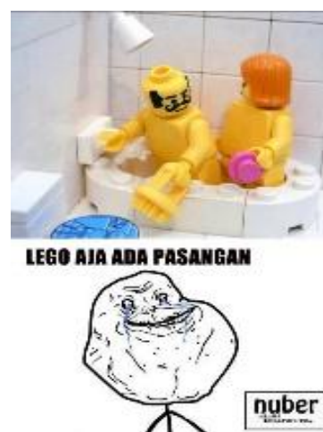
Panel 2: Even Lego has a girlfriend

The first concept built in the representation of FAG is as a single. In the data collected, there are some strips that represent FAG as a single in a negative way. There are three concepts constructed in this point, which draw ‘single’ as those who desperately need to be in a relationship, unattractive and coward.