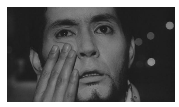
Figure 8. The man in the mask looks into his bleak future

while experiencing deep anxiety, absurdity and nothingness in life" (Jafari & Pourjafari, 2013, pp. 1-2). The close-up shot of the man in the mask below clearly shows anxiety and uncertainty, fittingly reflects Abe's idea of identity which is, "... changing and unstable, and the feeling of not belonging to a place is something individuals should actively seek" (Habjan, 2016, p. 73).