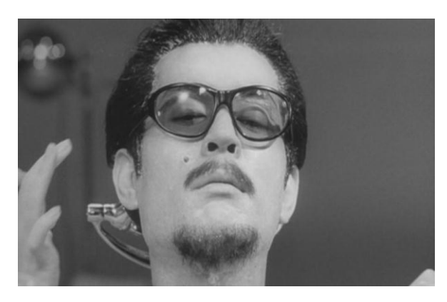
Figure 6. The first appearance of the man with his 'mask'

The first appearance of the man on the film as seen in figure 5 is from his back, and the audience can see that his head is fully bandaged. At this point, the man is still anxious about whether he has to wear a mask or not. The anxiety that he experiences is interpreted through the shot of the man from the back. Gradually, however, he becomes determined to have a mask and even plans to lead a double life with a single purpose to trigger jealousy of his wife and others in general.