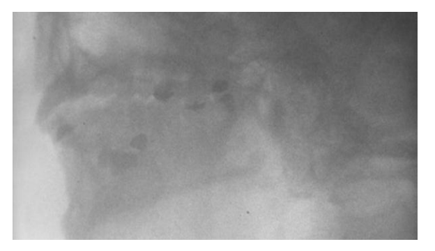
Figure 3. An x-ray scene of the man

visualized by the sophisticated yet intimidating laboratory and the activities within it. Both the novel narration and the film visualization of the mask construction reflect the narrator's hope to reduce the problem of his identity crisis to technical terms so he can solve it with technical means.