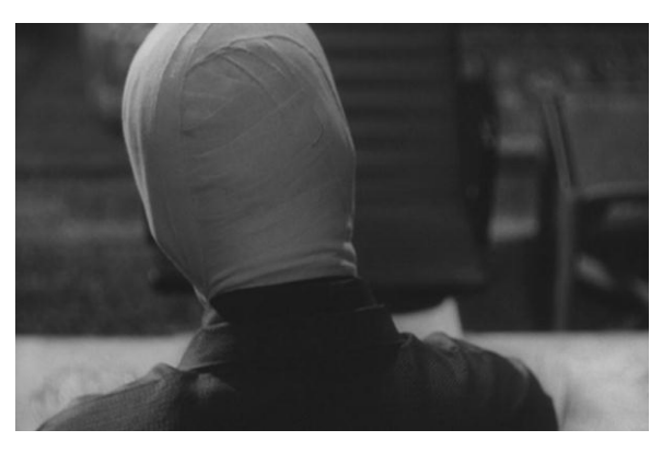
Figure 5. The first appearance of the man

The next chapter takes place several weeks after the preceding one, and takes us through the final steps of the mask construction and the first few times the man tries it on. The white notebook contains few technical passages; the language of the second chapter is more imaginative, referring to the dialogue inside the man's mind. However, this does not mean science's role is not important, in fact, science seems to start taking over the man. The imaginative language of the second chapter is gradually associated with the voice of the man wearing the mask as it tries to take over the man without a face. The mask is the product of science. Thus, it can be said that science, through the mask, begins taking over the man. Teshigahara shows this gradual taking over in the last eight chapters of the film. The inner conflict of the man is clearly externalized through distinctive shots of the man without a face and the man in the mask. (see figure 5 and 6).