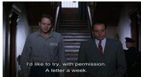
Screenshot 4. Strong structure and agent's negotiation with Warden Norton

As Warden Norton himself said that there were only three ways to spend the taxpayers' money for prison, namely for more walls, more bars, and more guards, which meant that a request for more books was sheer impossible. However, through his agency, Andy tried to negotiate with the Warden to get a permission to write letters. Actually, Warden Norton gave Andy a permission to write letters only to make him happy, but finally Andy's request was granted. This example shows that Andy's agency can change a part of the prison structure regarding the library although he needs to negotiate with the warden (representing the structure) to get the permission to write the letters. Thus, it shows that there is an interplay of Andy's agency and the prison structure.