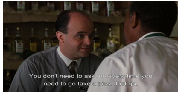
Screenshot 9. Institutionalization of structure

Giddens (1986) said about the basic requirement of social systems: "The structural properties of social systems exist only in so far as forms of social conduct are reproduced chronically across time and space. The structuration of institutions can be understood in terms of how it comes about that social activities become 'stretched' across wide spans of time-space" (p. xxi). Further he said that the "fundamental concept of structuration theory" is routinization (p. xxiii). This is what Red experienced, which he called as being "institutionalized" for forty years (Screenshot 9).