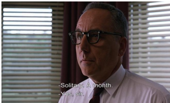
Screenshot 8. Norton made use of the prison structure as a warden with legitimate power to determine people's life and behavior

story told by Tommy Williams, Warden Norton insisted on not finding the truth because of the two reasons mentioned earlier. When Andy persevered to get justice and pushed Norton by mentioning something about laundering the tax money, he was put in a solitary cell for a month (Screenshot 8). This cell effectively made someone suffer a lot so that Andy later on even admitted that he was guilty and quitted his idea of getting justice in line with the structure or system since he schemed his own way to find one. This example shows how the structure of the prison which gives a big power to the warden changes Andy's behavior and belief in his helplessness. It can be said that this example shows the interplaying working of prison structure and Norton's agency. Norton will not be able to exercise his agency if he is not taking the position of a warden in the prison structure.