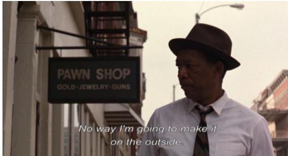
Screenshot 5. Prison structure’s grip on Red after 40 years of being institutionalized

could ever die. Finally, Red made the choice to go and meet Andy, otherwise he would have ended up in prison all his life. In the room where Brooks carved on the wall “Brooks was here”, before committing suicide, Red also carved a similar sentence next to it “so was Red”, making a different choice to keep up living outside prison although the conclusion was unclear to him at that point (Screenshot 6).