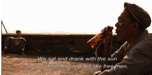
Screenshot 2. Andy's agency created a different atmosphere

The second example of Andy's agency was when Andy asked for some fund to add the book collections of prison library from Warden Norton. Of course, changing the structure in the prison regarding the library could be said to be impossible. Based on Brooks' experience (the inmate librarian) who had been imprisoned for more than 50 years and who had experienced six times of warden change, the request for fund to add the library book collections was never granted (Screenshot 3). However, with Andy's resource of financial and tax knowledge, which finally made Warden Norton also ask Andy for financial advice, Andy was allowed to write a letter to the Senate once every week (Screenshot 4). After 6 years of sending letters without break, Andy's request was granted. From the three-layered structure, it can be seen that Andy employs the resource of his relationship (facility) with the warden to get a permission to write letters to the Senate (domination) and the modality he applies to communicate is an interpretive scheme of "education" which finally gives power to him to get what he wants.