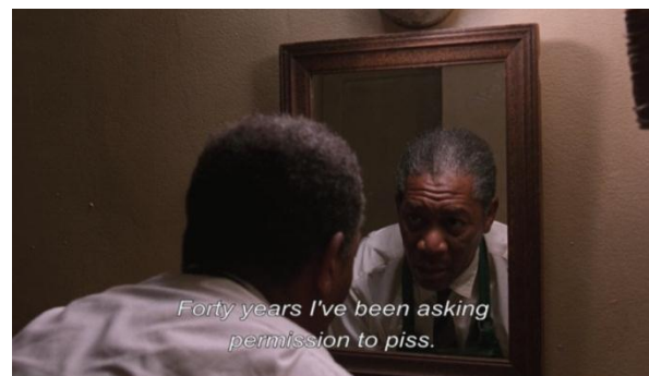
Screenshot 10. Routinization as the grounding of social life

In Red's case, although the role of structure was so strong, helped by Andy's agency, Red's agency appeared as he finally chose not to buy a gun and committed a crime again to be sent back to the prison. His consciousness and purposiveness enabled him to break loose from the grip of prison structure. This example shows again the interplay of Red's agency vis-a-vis prison structure.