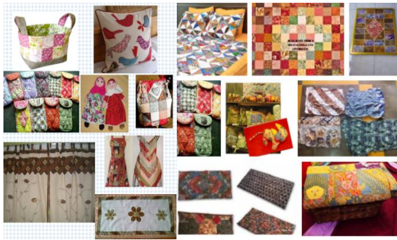
Picture 10. Patterned Indonesian batik quilts can be on all sorts of household accessories

https://www.google.co.id/search?q=kain+perca+batik+images&tbm=isch&source=iu&ictx=1&fir=s9LV5RtDPgJCdM%253A%252CSGA0YqGb1PsIYM%252C_&usg=__PO9aNISSpWb_sZufej_Wu77JnxU%3D&sa=X&ved=0ahUKEwjH_suYs4HaAhVKOY8KHcmIBnoQ9QEIPDA#imgrc=s9LV5RtDPgJCdM