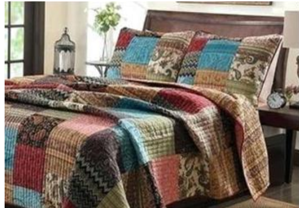
Picture 9. Indonesian batik on a bedcover and pillows

quilt patterns and colors. This is especially relevant when discussing about the pillow and bedcover quilt seen in picture 9.