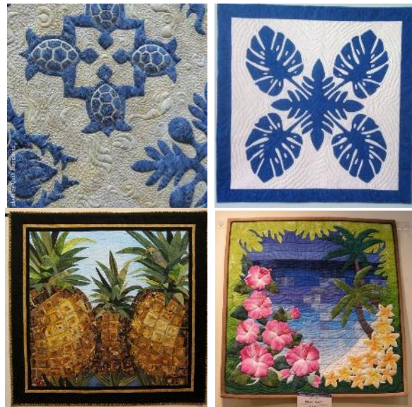
Picture 7. Alternative Hawaiian patterns and colors

Interestingly, the leafy pattern can be alternated with an animal pattern such as the four blue turtle as though holding hands to make a square or be as modern as making an embroidery of using fruits, such as the popular honey gold pineapple, or a beach applique pattern like the pink hibiscus flower on the left corner with yellow plumeria and two coconut trees in front of blue ocean in picture 7 below.