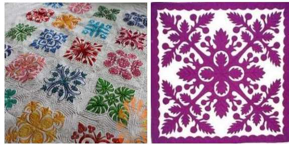
Picture 6. Flowery colored patterns of purple, green, red, orange and blue of the Hawaiians

Indians' quilt that are tailored, the Hawaiian leafy pattern is embroidery sewn (see picture 6).