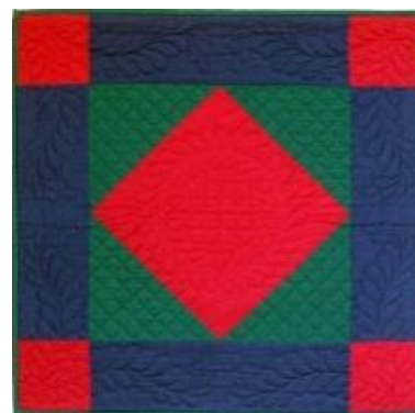
Picture 4. Blocked quilt pattern of red, green and blue color of the Amish people

By comparison, as can be seen in Picture 4, the center piece is a red diamond placed on top of a square green. Or looking at it from another angle, the red diamond has four green triangles at the sides to make a square box. On the outer side of the box are small red squares on each of the tip or corners of a larger square, with blue rectangles in between the small red squares. This kind of blocked quilt patterning is usually used by the Amish people. In viewing this, through a semiotic analysis, the centeredness is interpreted as one of the American cultural value of power of authority that is relied on the center. In other words, to become powerful, Americans believe that there is a need to be at the center of attraction.