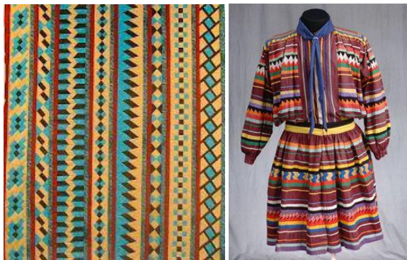
Picture 5. Striped patterned quilt of bright yellowish orange, blueish green, and reddish brown purple color of the Seminole Indians

This colorful idea for quilts is also employed by the cultured and vibrant attitude of the Hawaiians and Seminole Indian Americans who are always hoping for a good life with nature. This is why the result of their quilting is sewn up not only as blankets but also for their jackets and dress, which are usually made in colorful stripes or flowery patterns like shown in picture 5.