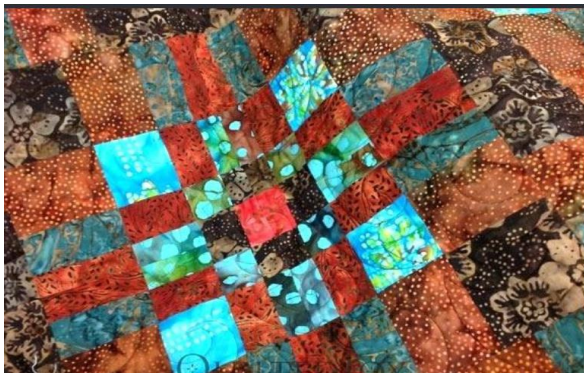
Picture 8. Vibrant colors with blocked log cabin and star Seminole Indian and Hawaiian pattern is followed by Indonesian batik quilts

Observing the kinds of colors and patterns of Indonesian quilts, there are traces of not only the pattern but also of the colorful Seminole Indians and Hawaiian quilts. Not only do Indonesians use the dark colors of brown, black, dark red mahogany which usually becomes the traditional colors of batik; but they also use vibrant bright ones such as the light blue, green, yellow, orange and pink colors.