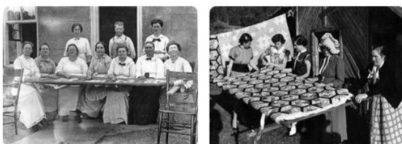
Picture 2. The quilting bee