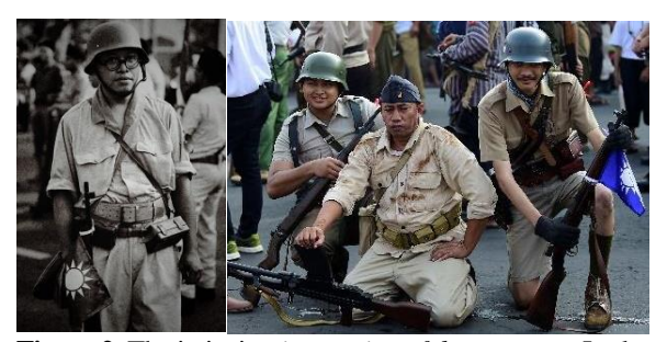
Figure 2. The imitating impression of the reenactor Laskar Kuomintang in the theatrical drama commemorating November 10, 2018.

Readings about the Surabaya war at this time are also understood to be a critical narrative of proving the existence and legacy of minority groups against hoaxes of fundamentalists who negate their participation in the history of the struggle for Indonesian independence. Namely when the reenactor had the impression of imitating Laskar Kuomintang in the theatrical drama commemorating the Surabaya War in 2018 as a representation of the Chinese existence in the struggle against the Allies, as shown in Figure 5.