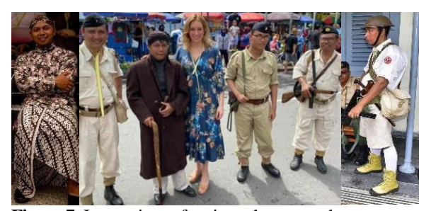
Figure 7. Impressions of various characters, the reenactors imitate the historical figures of the Oemoem Attack on March 1, 1949, General Sudirman, Lieutenant Colonel Suharto to the imaginative figure of Sergeant Tobing.

The reenactors who were dissatisfied with such conditions together with their group then made scenes in the form of short videos that were more concerned with the authenticity and accuracy of the outfits and gears used.