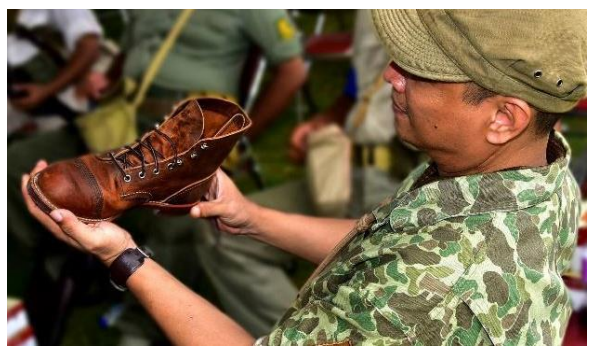
Figure 4. Stock replica of British jungle boots as the model used by the Speciale Troepen Corps (KST) troops, one of the Dutch special forces involved in the SO battle.

Because apart from selling, there are often discussions between traders and buyers that give rise to critical expressions of merchandise, especially in relation to the historical authenticity associated with the merchandise.