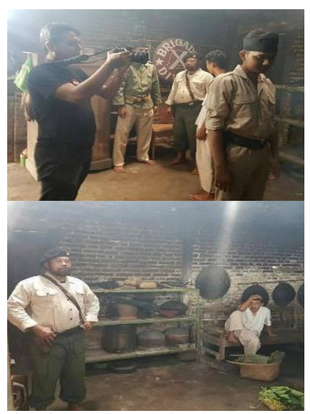
Figure 9. Shooting of a short film with the theme of the Oemoem Attack on March 1, 1949 by the Community of Djogjakarta 1945.

Media is me, an expression of the reenactor of the choice of media freedom that carries a critical spirit towards various forms of media establishment and power. People may have opinions, but later on, an assertive agreement will be formed that is flexible and quickly melts back. For example, the narrative of the involvement of santri in the November 10 battle as called the resolution of jihad has been passed down from generation to generation in Islamic boarding schools until now. Including various supernatural powers by the students in the battle in Surabaya, although in the New Order version of the historical narrative, the role of the Islamic boarding school students, including the Chinese group in the process of writing national history, is not explained. But the students remember it well and preserve the story from generation to generation through various opportunities and accessible media. Therefore Instagram, Youtube, Twitter, Facebook become their channels. There is always an opportunity to fight against power, without being anarchist and confrontational.