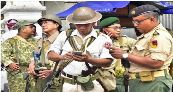
Figure 1. Reenactors impression of soldiers during an event at the War Memorial