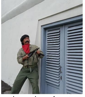
Figure 6. Various impressions, characters of Dutch KNIL soldiers and fighters. The figure of the piped man is an active police officer on duty in the Magelang Regency area.

In the perspective of historical authenticity, it is considered as a form of chaos that has the potential to obscure historical facts. It's as if the visual aspect becomes less important, just a supporting image, or becomes just a generation of impressions about the history of the war of independence. In stark contrast to the impression built through the analysis of competent historians, eyewitnesses and prioritizing methodological aspects.