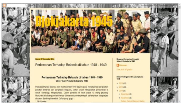
Figure 3. Community page of Djogjakarta 1945

These historical stories were then summarized in many articles with the theme of Resistance to the Dutch in 1948-1949, on their blogspot. See more at http://djokja 1945.blogspot.com/2014/11/perlawanan-terhadap-belanda-di-tahun.html. As in the photo below.