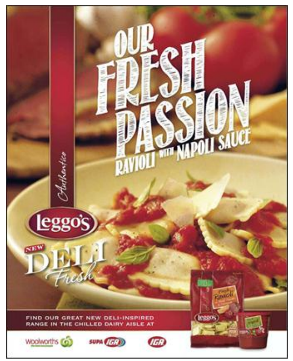
(Delicious, December, 2011/January, 2012, p. 129)

entity, or an object. 'Fresh Passion' which is a nonphysical or abstract thing is seen as an object or an entity so that the utterance 'Our Fresh Passion' is a metaphorical expression. This way of viewing nonphysical thing as an entity or an object is used in ontological metaphor (Lakoff and Johnson, 1996; Kövecses, 2010). Thus, ontological metaphor is realized here. Since 'our' shows a possessive form, the ontological metaphor is used for the purpose of identifying aspects, that is, the aspects of fresh passion that belongs to 'us'. The word 'us' refers to the one that writes the advertisement, that is, the advertiser. Thus, the aspect of fresh passion belongs to the product called Leggo's New Deli Fresh. The metaphor conveyed is PRODUCT IS AN ENTITY metaphor.