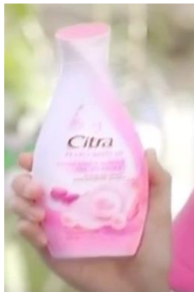
Figure 3. The model shows Citra Hand and Body Lotion to turn dark skin into light skin

From that, I conclude that Citra Hand and Body Lotion has some uncomfortable connotation meaning about the skin color and the happiness of the women. Muzakhir (2019) adds that this commercial brings up the ideology and that is the beauty hegemony with the version of white skin ala Korean women. Where, the brown skin or the fair skin is not considered as the beauty indicator. In my opinion, this kind of hegemony will drive the Indonesian women who were born with non-white skin into the great insecure and unconfident. This kind of issue is girl's matter in having a beauty standard because it can put all girls in unhealthy internal condition such as anxiety, mental disorder, and other bad psychological conditions. In this paper, I will do the analysis on Citra Hand and Body Lotion posters. This paper aims to analyze the beauty standard that Indonesian girls should have based on Citra Hand and Body Lotion posters and to compare Indonesian girls' beauty standard from 1900's to 2000's.