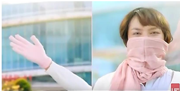
Figure 1. A woman wears long sleeves jacket and mask to protect her skin from the sun