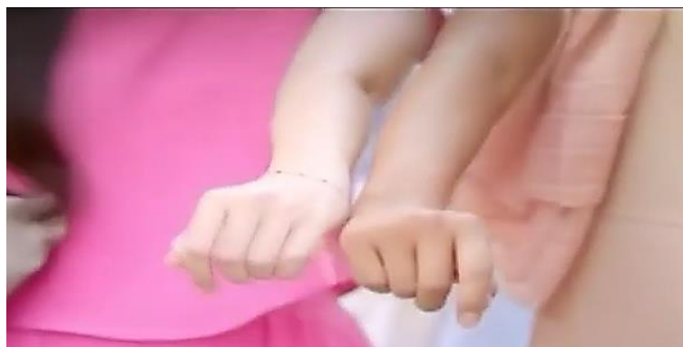
Figure 2. The comparison between the after using Citra and the one without Citra

Muzakhir (2019) makes the conclusion of his research that there are five connotation meanings of this Citra Pearly White UV Hand and Body Lotion commercial above: